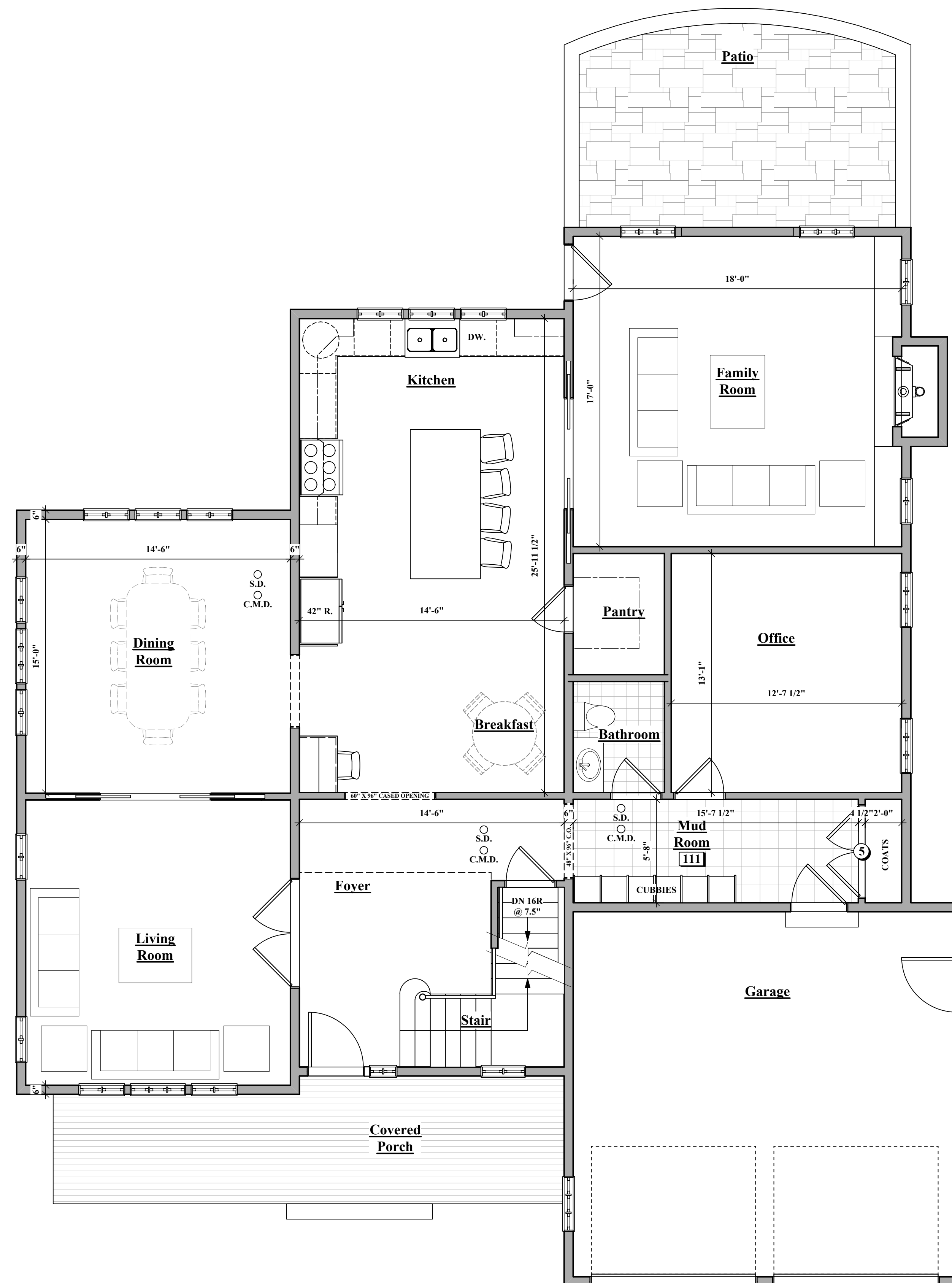
1 A-1.2 First Floor Plan 1835 SF LIVING AREA Scale: 1/4" = 1'-0"